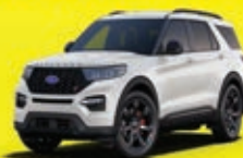
2020 Ford Explorer ST

All American 3 GREAT LOCATIONS IN OCEAN COUNTY WITH THE LARGEST SELECTION AND BEST PRICES!