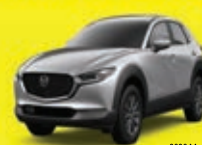
2020 Mazda CX-30